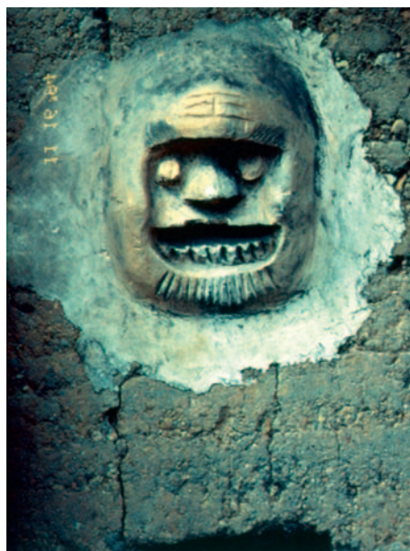
f0030 FIGURE 34.3 A tiger talisman in Zhongping village, Meihuashan Nature Reserve. This clay tiger face and other tiger icons are sculpted on house roofs and walls to ward off evil spirits.

of clay effigies on the walls of rural homes (Fig. 34.3), miniature figures sewn into children's shoes or hats, and other talismans, all of which have the character for 'king' ( wang ) on their foreheads—three horizontal lines bisected by a vertical line. The vertical line represents the just ruler, uniting heaven, the people (and other beings), and the earth.