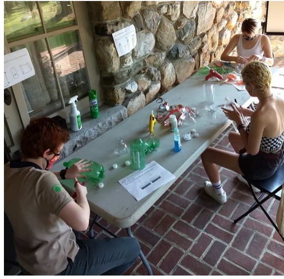
Students making reproductive health training tools out of recycled plastic.